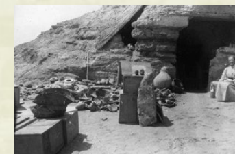
The excavation site in Hierakonpolis, Upper Egypt.