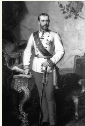
The Late Crown-Prince Rudolf of Bavaria

Empress Elisabeth has been travelling, avoiding Vienna for the last 9 years, and seems content to do so until the day she dies.