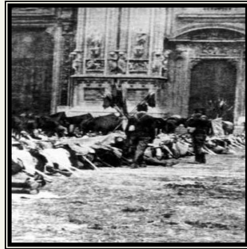
The Beccari's army prepared to face protestors at Piazza del Duomo, Milan

According to the Italian Government, 118 people were killed and 450 wounded, while the protesters claim the actual numbers are 400 dead, and 2,000 injured.